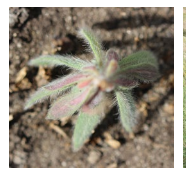
Figure 2: Underside of kochia rosette

Flowers: Inconspicuous since they lack petals but have five sepals. Flowering can occur from July to October.