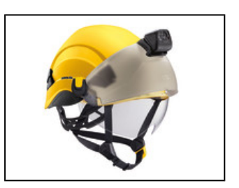
With the ability to integrate a Petzl headlamp, face shield, hearing protection, and multiple accessories, it is an entirely modular helmet, meeting the additional needs of professionals.