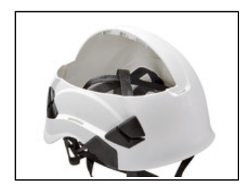
The six-point webbing suspension system adapts to the shape of the head to provide maximum comfort.

The VERTEX helmet is very comfortable, with a six-point textile suspension as well as CENTERFIT and FLIP and FIT systems, which provide a secure fit on the head. The adjustable-strength chinstrap makes it ideal for both work at height and on the ground. The unventilated outer shell protects against electrical hazards, molten metal splash, and flames. With the ability to integrate a Petzl headlamp, face shield, hearing protection, and multiple accessories, it is an entirely modular helmet, meeting the additional needs of professionals.