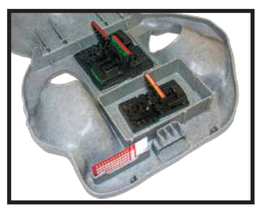
Place JAWZ<sup>™</sup> Mouse Traps In Wells