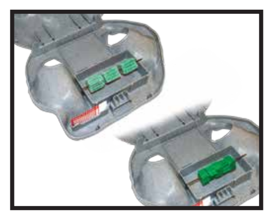
Use With 1 oz. BAIT BLOCK<sup>®</sup>, .5 oz. TOP GUN BAIT BLOCK<sup>®</sup> Or NECTUS<sup>™</sup> Soft Bait