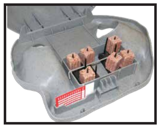
Use With Green's Vertical Bait Holder