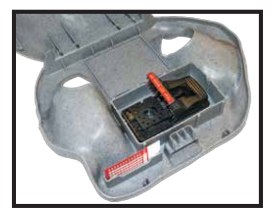
Insert JAWZ<sup>™</sup> Rat Trap In Bait Well