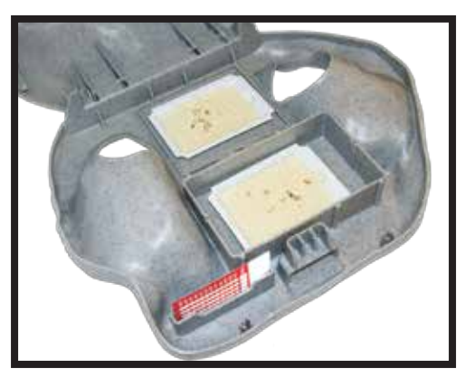
Use With STICK-EM® Mouse Glue Traps