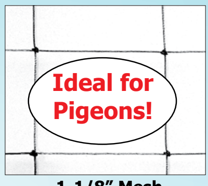
1-1/8" Mesh Starling / Pigeon