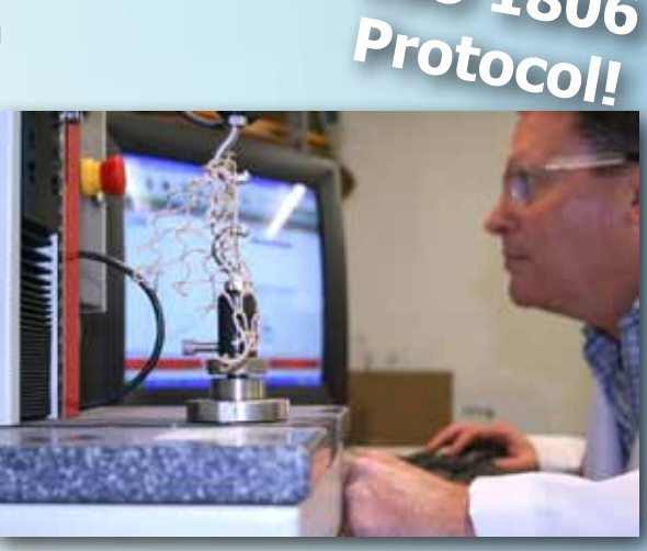
Actual Testing Procedure