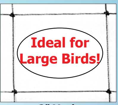
2" Mesh Pigeon/Seagull

Heavy Duty Bird Netting is most effective when installed properly. Improper installation can lead to sagging or drooping of the net, leading to gaps that birds can get in through. We recommend that a cable be set up around the perimeter of the area being netted off, and the net attached to this cable. Bird-B-Gone offers a complete line of hardware to accommodate any netting job.