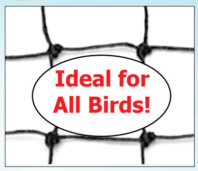
3/4" Mesh All Birds